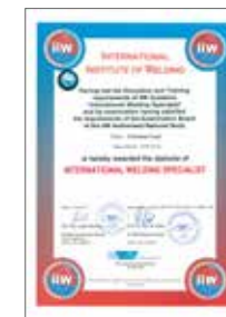
International Welding Specialist