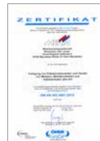
DIN EN ISO 9001:2015

Have a look at some certifications of our company: