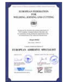
Dipl. European Adhesive Specialist