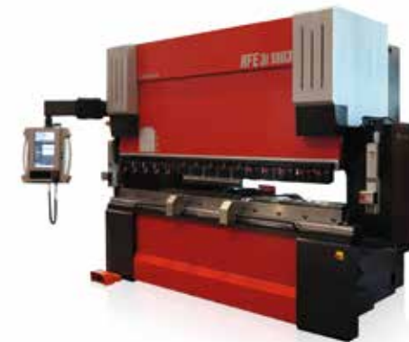
folding machine AMADA HFE-3i-220.3