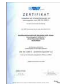
Zertifikat DIN EN 15085-2 CL1