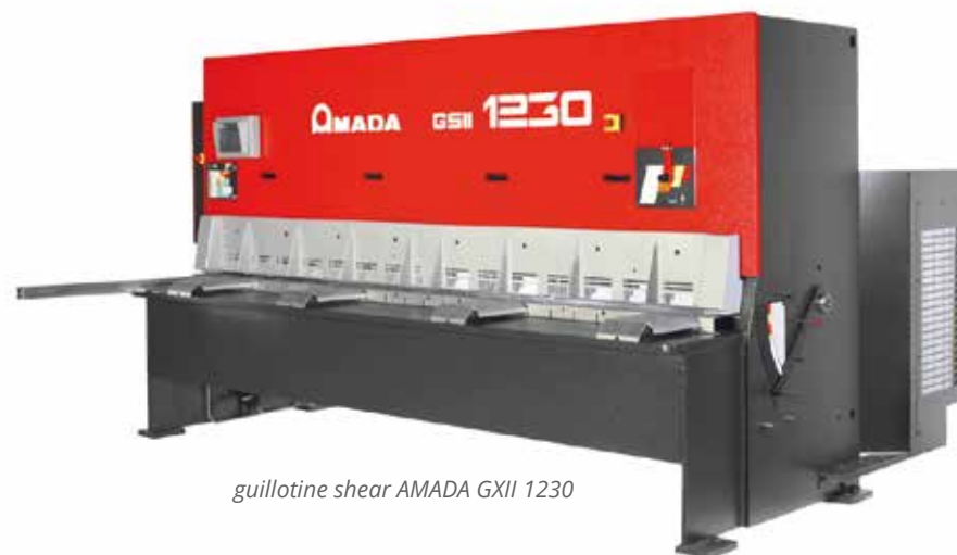
guillotine shear AMADA GXII 1230